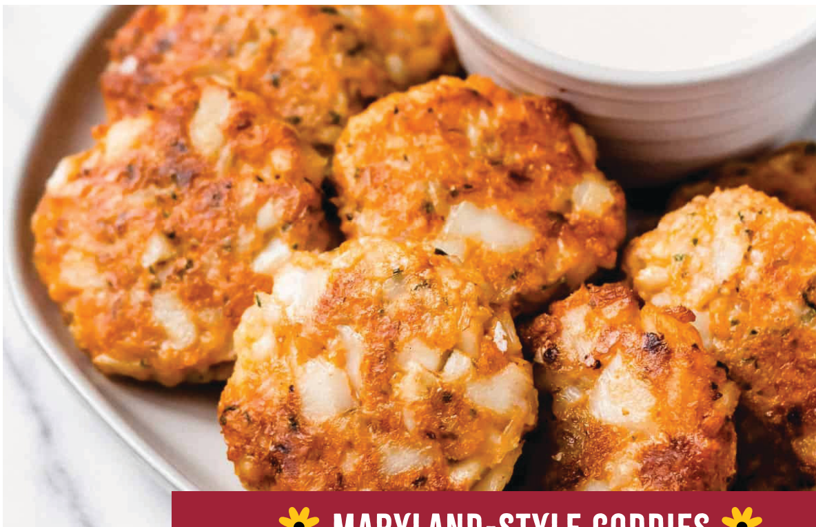
☀️ MARYLAND-STYLE CODDIES ☀️