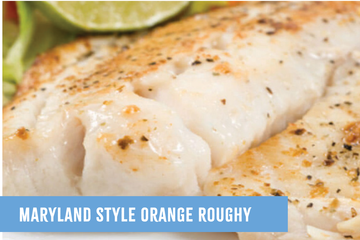
MARYLAND STYLE ORANGE ROUGHY