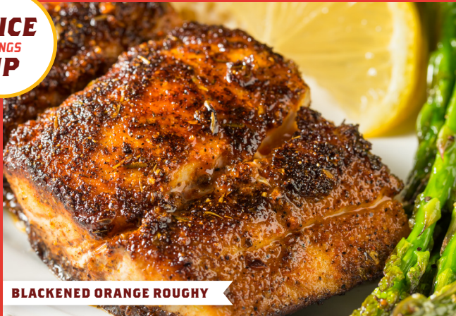
BLACKENED ORANGE ROUGHY